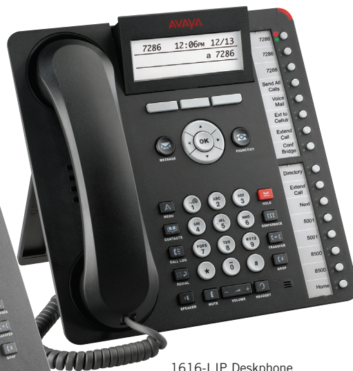
1616-I IP Deskphone