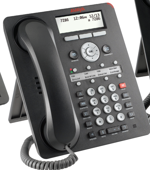
1608-I IP Deskphone