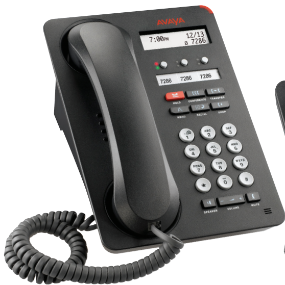
1603-I IP Deskphone 1603SW-I IP Deskphone